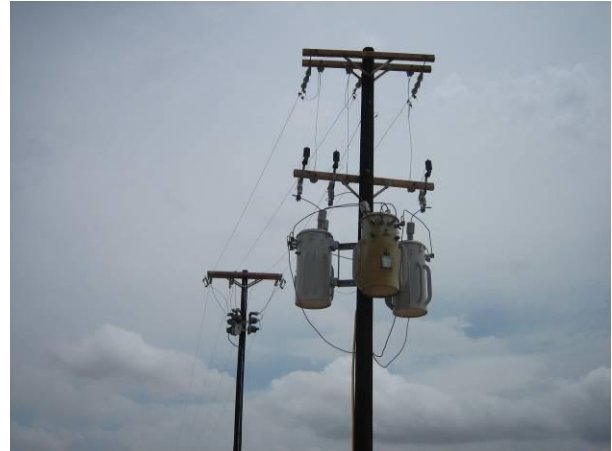
Figure 3: Un-terminated electrical line

Although utilities accept this risk, engineers for critical production operations require one span to be built past any transformer bank with arrestors on the end poles. This moves the open line reflection away from the transformer.