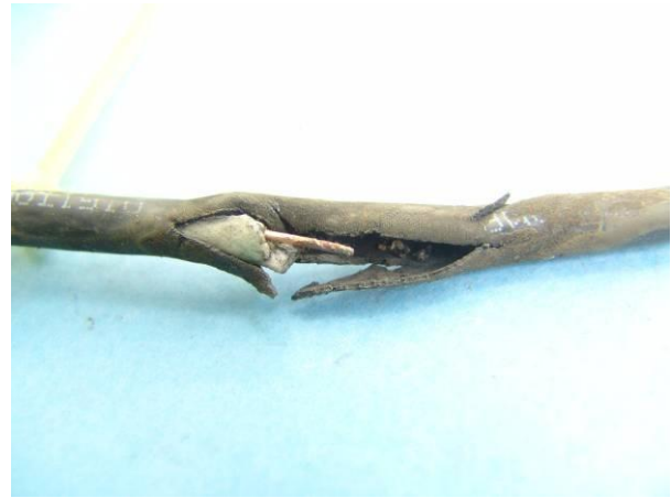
Figure 8: Damage from ungrounded coaxial cable

In similar scenarios, the braided shield had tiny beads on each strand. The foam filler was melted and had flowed due to the energy.