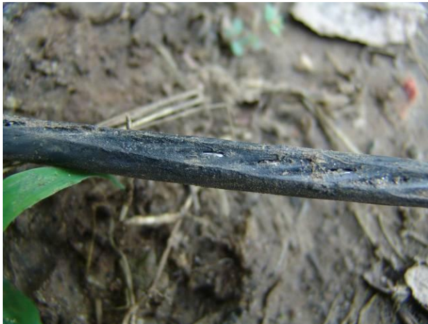
Figure 4: Damage from overheated neutral

combustibles. A disconnected or floating neutral at the service entrance can result in a failure anywhere in the electrical system.