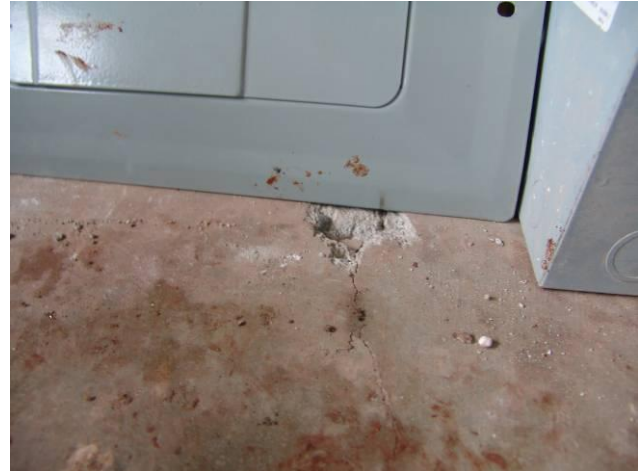
Figure 5: Damage from unbonded rebar

Lessons Learned: The ground path to ground electrode (rod) must be low impedance with no sharp bends causing inductance. The ground electrode (rod) must have low contact resistance. The concrete is an excellent conductor. Rebar must be bonded to provide low potential difference. Any large surface metal provides a preferred path rather than the relatively small AWG 4 copper ground wire.