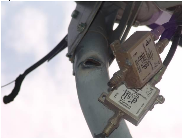
Figure 7: Damage from ungrounded satellite dish

Lightning struck the post of an ungrounded dish mounted to a roof. A hole was blown in the steel post. The cable splitter was destroyed at the terminations. The cable jacket was split but otherwise appeared intact. The foam filler, shield, and copper had become plasma and vaporized.