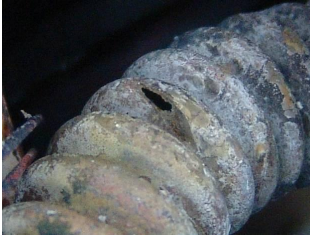
Figure 6: Damage from unbonded gas pipe

by lightning energy. The widening and narrowing of tubing creates an un-terminated waveguide for electromagnetic energy resulting in reflected waves and doubling of the waveform. Local bonding is necessary to any metal within about a foot.