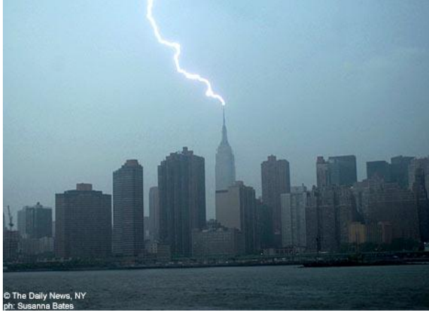
Figure 9: No damage to Empire State Building

This is a very visible demonstration that with adequate design, installation, and maintenance, lightning can be managed. Lightning discharges cannot be prevented. They are an act of God. However, they can be controlled. Not doing so may tend to be an act of negligence.